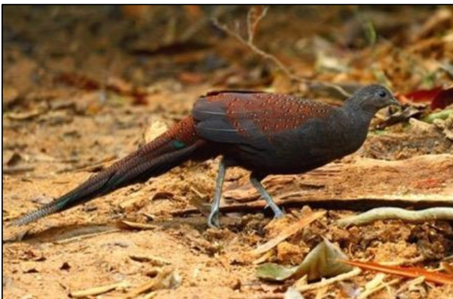
Mountain Peacock-Pheasant

Bukit Tinggi. The hill station of Bukit Tinggi is an excellent montane forest birding site. This locality is a relatively new and exciting addition to our regular route, and is most famous for being one of the only sites on Earth where one has a realistic chance of seeing the rare and until recently, mythical Mountain Peacock-Pheasant. This regal pheasant is endemic to the Malay Peninsula but due to its shy nature, rare status and difficult to