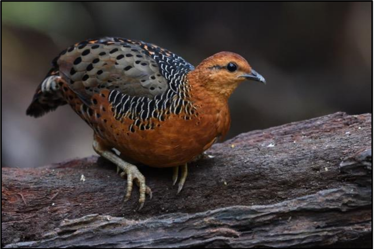
Ferruginous Partridge

Malaysia is a developed Asian nation offering first-class facilities, an extensive range of well-serviced national parks and nature reserves and a bounty of quality birds and mammals; simply put, this is the perfect destination for a birding tour! This week-long extension combines some of Peninsula Malaysia's most famous birding sites including Fraser's Hill, the immense Taman Negara National Park, and Bukit Tinggi. Habitats range from lowland and montane rainforests and these host a rich mix of typical south-east Asian birds as well as several rarely seen species. Join us for what is sure to be an awesome, exotic blend of fabulous birds, mammals, and amazing scenery!