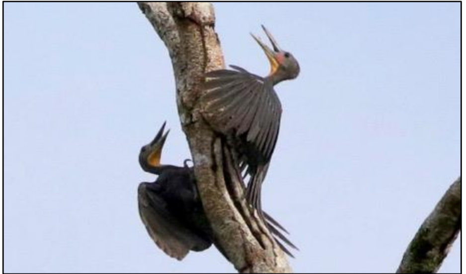
Great Slaty Woodpeckers

Checker-throated, Buff-necked, Rufous, Orange-backed, Buff-rumped and extremely scarce Olive-backed Woodpeckers, Rhinoceros, Bushy-crested and White-crowned Hornbills, Red-naped, Diard's, Scarlet-rumped and the very rare and shy Cinnamon-rumped Trogons, Square-tailed Drongo-Cuckoo, the shy Rusty-breasted Cuckoo, Black-bellied, Chestnut-breasted and Raffles's Malkohas, the elusive but stunning Rufous-collared Kingfisher, Red-throated, Yellow-crowned, Sooty (recently split from Brown Barbet) and Golden-whiskered Barbets, Puff-backed, Hairy-backed, Yellow-bellied and Grey-cheeked Bulbuls, the vociferous Fluffy-backed Tit-Babbler and the richly-coloured Black-throated Babbler.