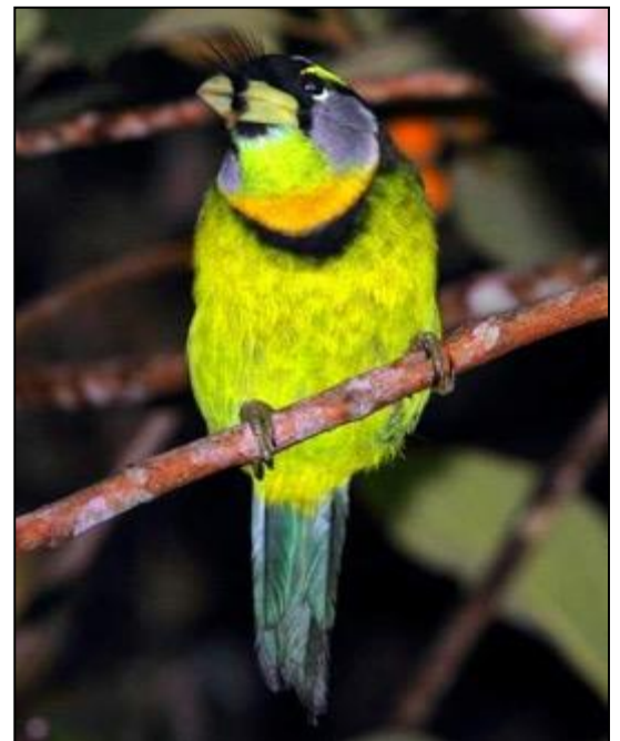
Fire-tufted Barbet by Adam Riley

During our time here, we'll also venture downhill on at least one occasion to an area called the "Gap", which is a zone of beautiful, mixed broad-leaved forest and bamboo at the base of Fraser's Hill and covers the altitudes from 700 to 1200 meters (2,300 to 4,000 feet). This is a superb birding area that supports numerous exciting forest birds and is often one of the highlights on a tour to Peninsular Malaysia. Some of the delectable birds we may see here include the regal Black Eagle, Rufous-bellied Hawk-Eagle, Orange-bellied and Blue-winged Leafbirds, Black-and-crimson Oriole, Grey-chinned Minivet, Velvet-fronted Nuthatch, White-bellied Erpornis, Orange-breasted and Red-headed Trogons, White-crowned and Great Hornbills, Chestnut-backed Scimitar Babbler, Hill Blue Flycatcher, Pin-striped Tit-Babbler, Black-and-yellow, Long-tailed, Silver-