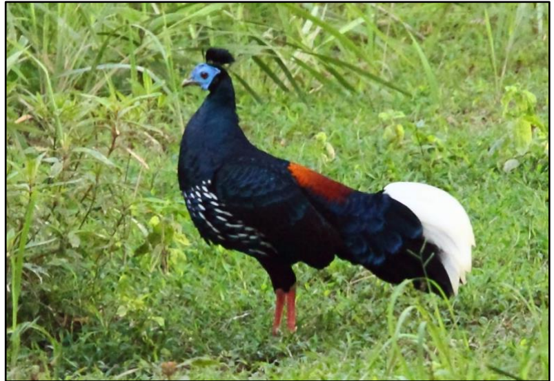
'Malayan' Crested Fireback

breasted and Dusky Broadbills, the near-endemic Black Laughingthrush, immaculate Sultan Tit, Red-billed Malkoha, the truly spectacular Red-bearded Bee-eater and three bamboo specialists: the vocal Yellow-bellied Warbler, unobtrusive Collared Babbler and the shy and enigmatic Bamboo Woodpecker, as well as the very rare and secretive Marbled Wren-Babbler or scarce, highly nomadic and little-known Yellow-vented Green Pigeon if we are very fortunate.