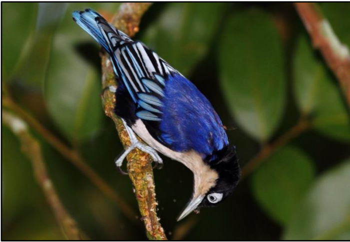
Blue Nuthatch by Glen Valentine

Fraser's Hill. The rather quaint highland town of Fraser's Hill is surrounded by excellent and rather extensive mid-altitude broad-leaved forest and is home to a host of fabulous birds.