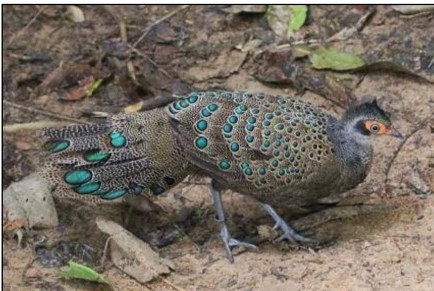
Malayan Peacock-Pheasant by Nigel Redman

There is often at least one fruiting tree somewhere in the lodge grounds and if we are fortunate enough to find one of these bird magnets then there is an excellent chance that we'll be able to obtain good, close views of a number of otherwise scarce forest interior or canopy species such as Golden-whiskered and Yellow-crowned Barbets, Greater and Lesser Green Leafbirds, Purple-naped and Plain Sunbirds, the dazzling Green Broadbill, Grey-bellied Bulbul and Crimson-breasted Flowerpecker, as well as outside chances at the rare, nomadic and elusive Jambu Fruit Dove, Black-and-white Bulbul and Scarlet-breasted Flowerpecker.