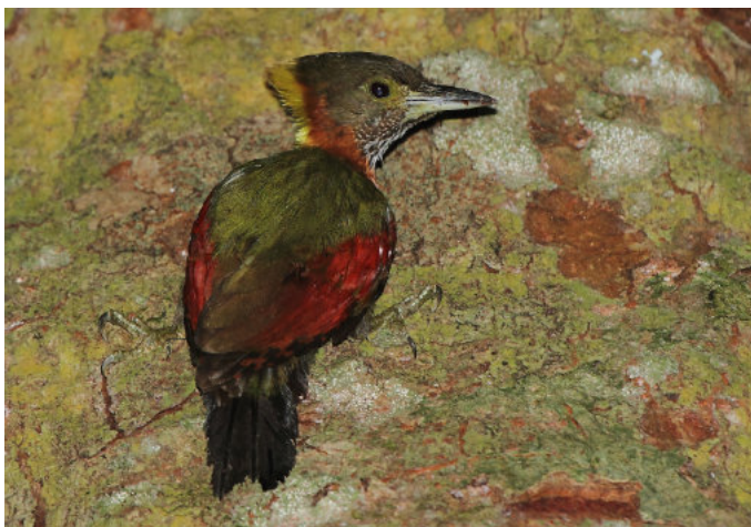
Checker-throated Woodpecker