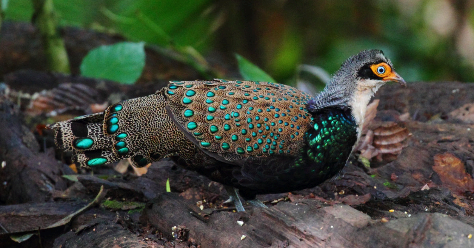
Bornean Peacock-pheasant