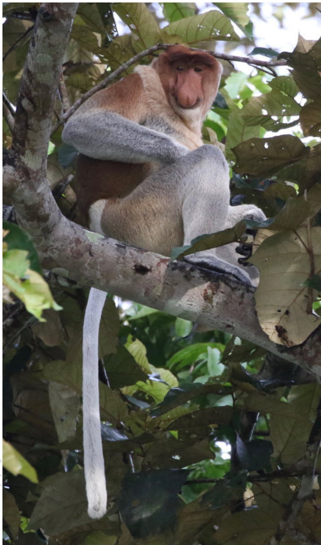
Proboscis Monkey