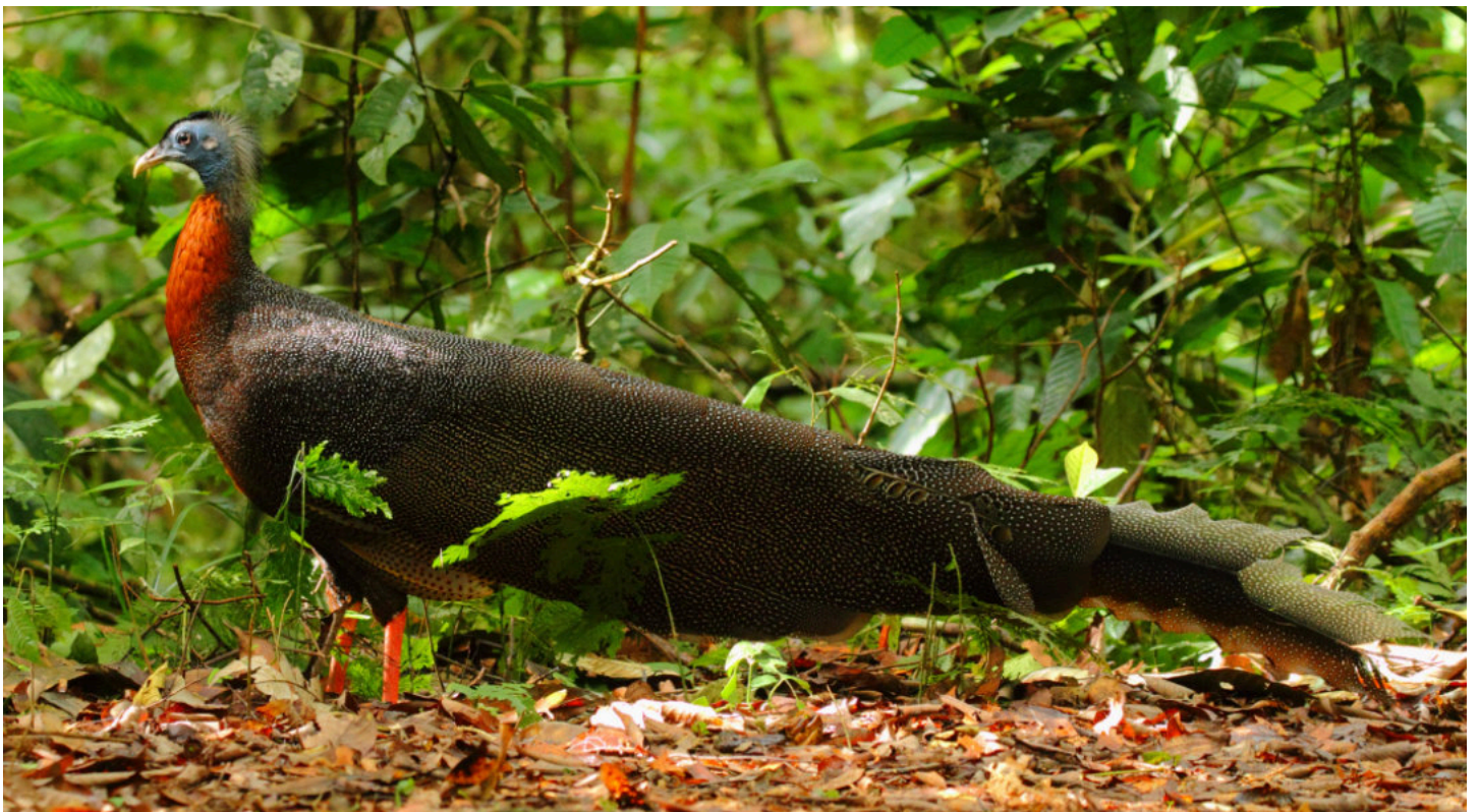
Great Argus

Most of our day will be dedicated to finding the mythical Bornean Peacock-Pheasant. From the trail head, we'll walk for around an hour on an easy trail to a purpose-built hide from where we'll wait for our quarry to put in an appearance. We also have excellent chances for Crested Fireback, Bornean Banded Pitta, Raffle's Malkoha, Diard's Trogon, Rufous-winged Philentoma and Rufous-tailed Shama.