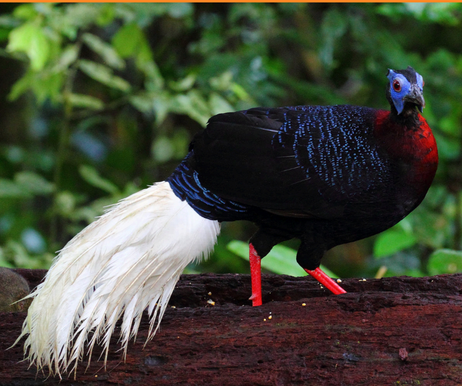
Bulwer's Pheasant